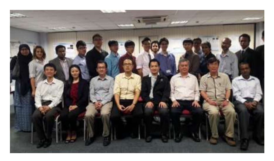
Figure 1: The students, panel of judges and organising committee