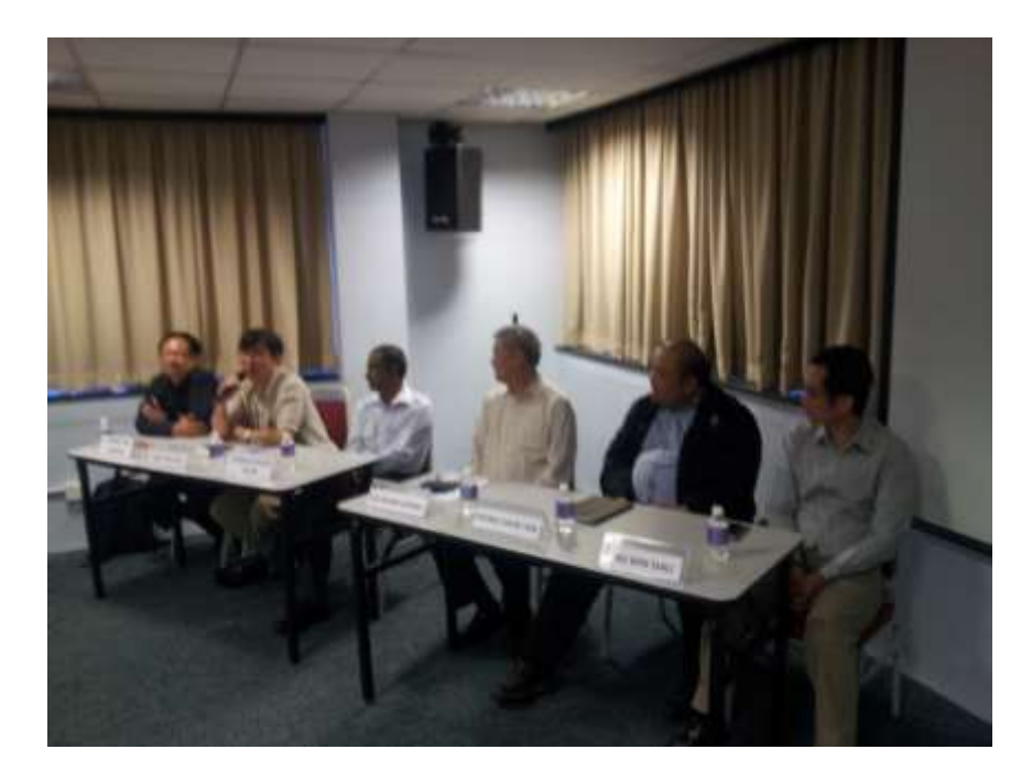
Figure 3: The panel of judges during the dialogue session