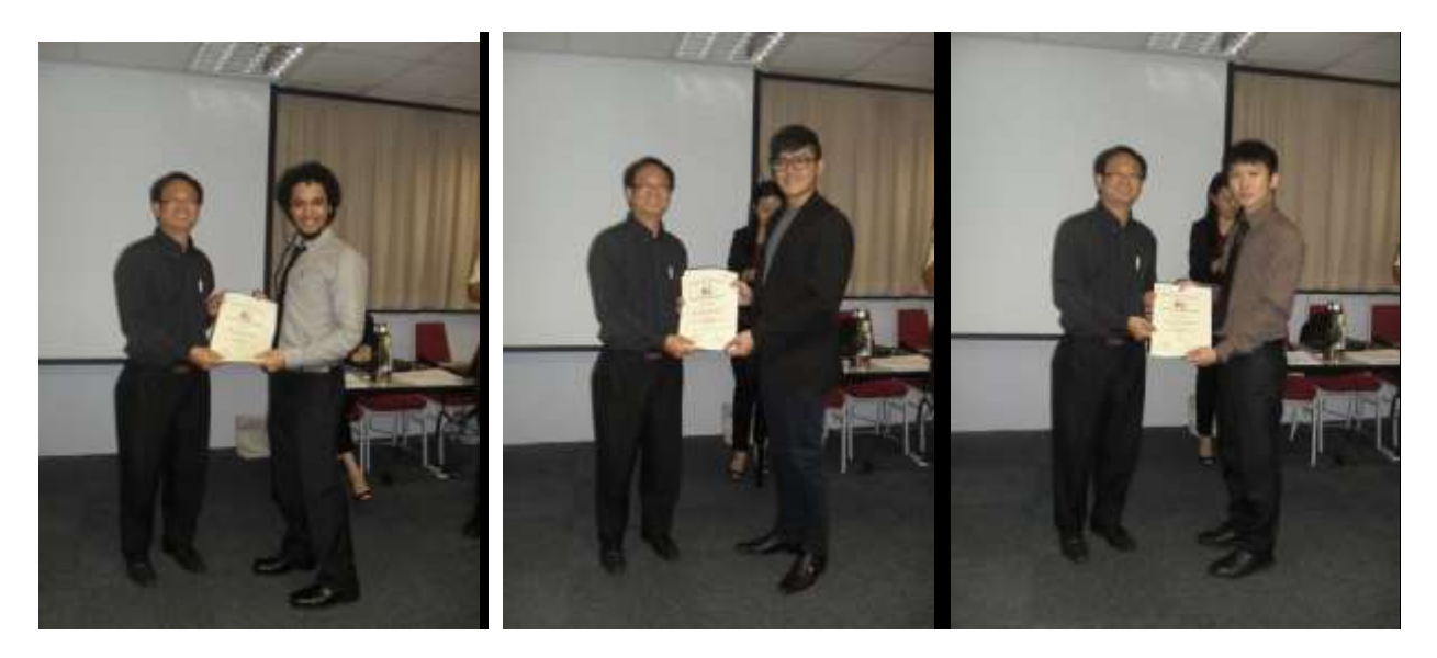
Figure 2: From left (The champion, first and second runner-up)